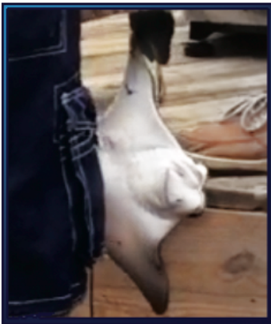
A dead baby at the weigh station.

That's how depraved and disgusting this slaughter was. After the tournament was over, these beautiful rays were dumped into the river like so much garbage.