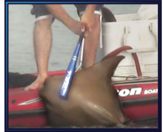
The rays were shot then beaten with bats.

At the weigh station we were told that, as the mothers were dying, they were giving birth, which made this already horrifying event even more tragic. In another conversation it was explained that the mother rays' birth canals were tied with plastic zip ties in order to keep their babies inside of them, so that the rays would weigh more. We also filmed one dead baby that was attached to its mother by a string. We recorded a bowhunter as he tried to push the dead baby back inside the mother.