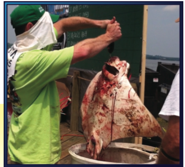
One of the many victims at the weigh-in station.

We are now working with Fish Feel on legislation banning such vile tournaments in Maryland. We will keep you informed as this campaign moves forward.