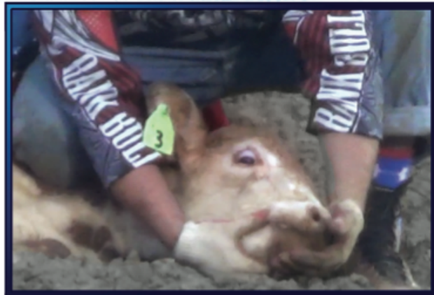
One of the innocent calves that was abused.

We called on the Sussex Christian School to not hold any future rodeos as fundraisers. We are very pleased to announce that on June 29th, 2015, we received an email from the school that said they will not host the rodeo next year. This was great news and we applaud the Sussex Christian School for choosing not to hold another cruel fundraiser!